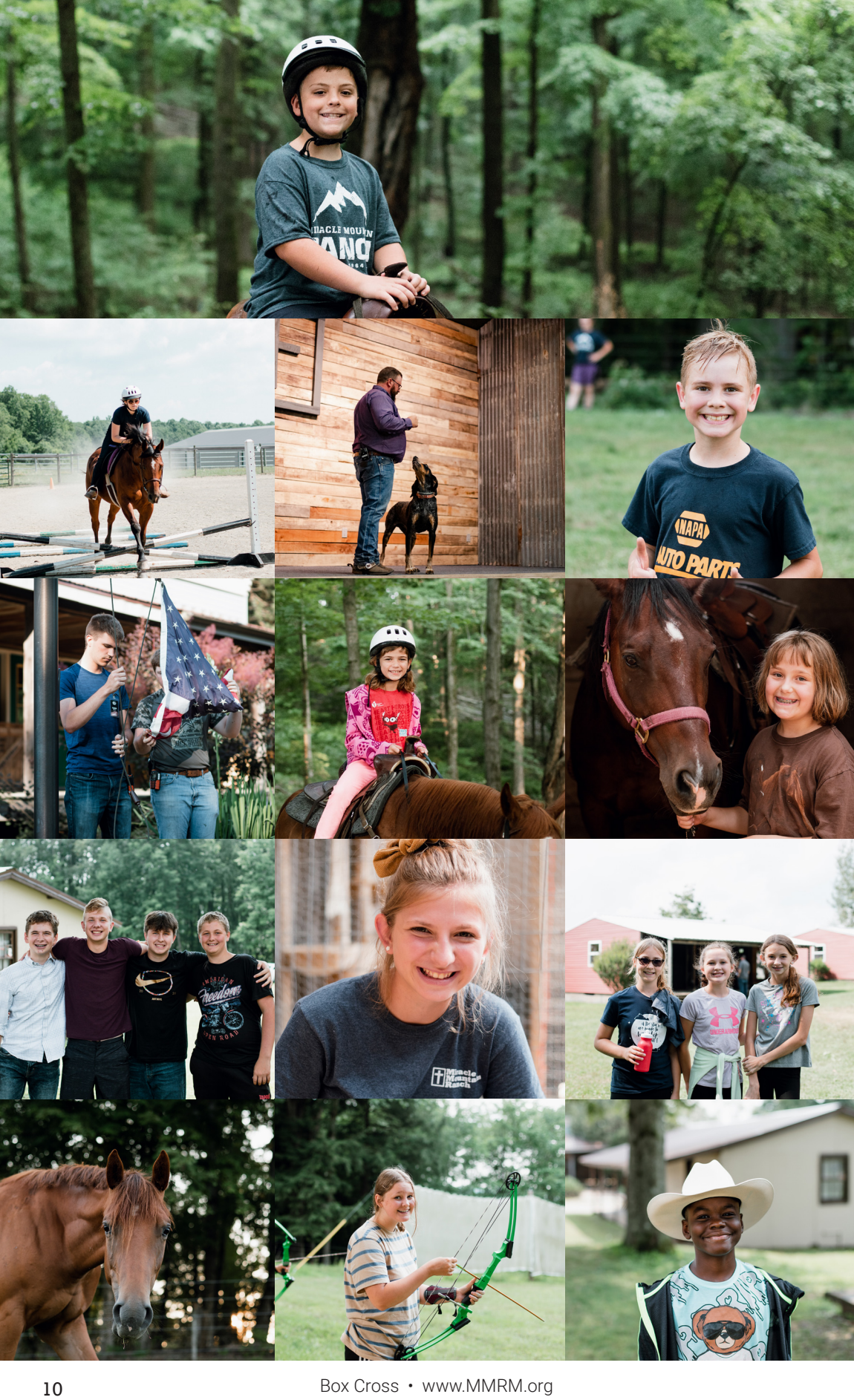
Box Cross • www.MMRM.org