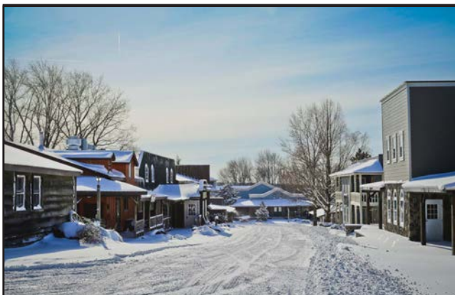
Main Street of our western town at the Ranch. Despite the length of the winter (as long as 7 months of snow), I really do enjoy the change of seasons. It's such a beautiful place to live and work!