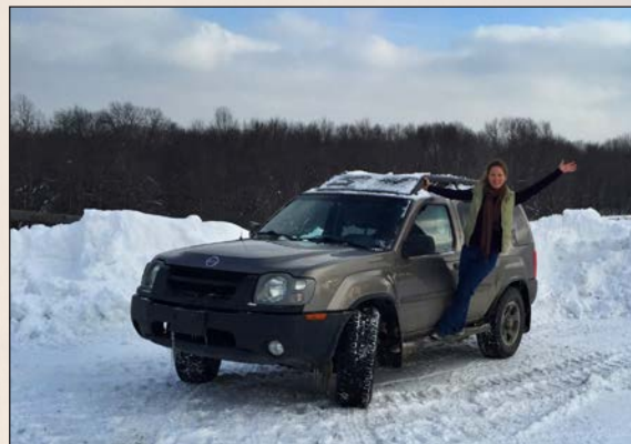
My very own wheels!

I was doubtful, but I kept it in prayer, and the Lord was faithful. Many of you upped your monthly support without even being asked, and others came out of the woodwork to jump on board. A local Christian used car dealership owner has committed to selling vehicles to the Ranch staff at cost and he was diligent to get me a great deal on the XTerra. To say that this experience has been humbling would be very much an understatement. THANK YOU SO MUCH!! It really is wonderful to have a vehicle! :)