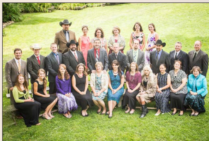
Miracle Mountain Ranch permanent staff

If you don't already have an understanding of our ministry here at Miracle Mountain Ranch, visit