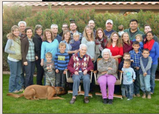
The AZ/TX side of the family - 4 generations!

Due to changes in our staff this past fall, I was able to move into more permanent staff housing (as opposed to dorm-style housing). I now live in "The Girls' Trailer" with Kara, one of the girls who run the barn (pictured next to me in the staff picture on the back). I love Kara dearly and we have a grand time together! It's been fun for me to have a goldily, older sister figure so close at hand. Our house is right in the middle of main camp, so our living room is a revolving door between the other single staff and