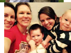
Hanging out and watching the Super Bowl