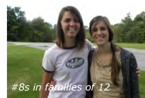
#8s in families of 12