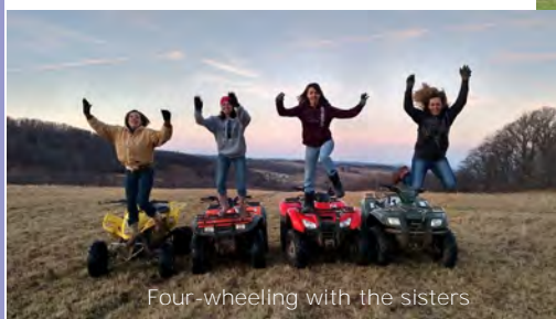
Four-wheeling with the sisters

In Proverbs 27:17 it says, "Iron sharpeneth iron; so a man sharpeneth the countenance of his friend."