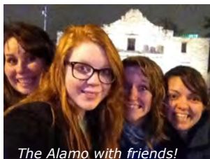
The Alamo with friends!

One of my most favorite things to do is spend time with my family and friends. Any of you have known me for any amount of time know that is true.