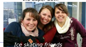
Ice skating friends