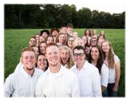
Above: The graduated Class of 2017 Look at all those smiles! Below: This year's class. 20 new students and 11 second year students.

Currently the students are in their second month of classes and Bible writing projects. Some of those classes include New Testiment Survey, Intro to Bibilical Counseling, Time Management, and Horsemanship. Among the student body we have 14 different states represented. This year