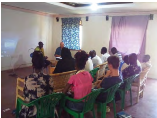
Pre-COVID-19 young adults' study of Jude at my parents' house in Busia.