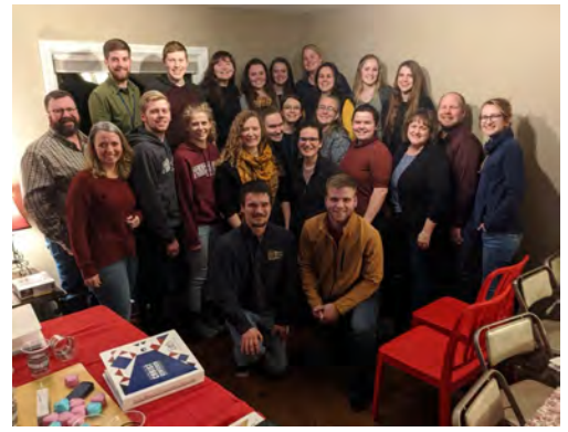
The Ranch's BCTC crew!