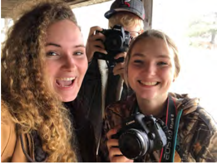
Taking two of my students out on a photo walk!